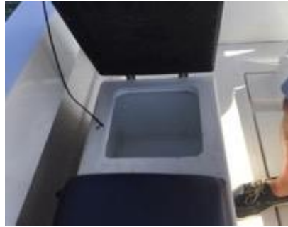
ARVOR 20 TWO LARGE BUILT IN ESKIES UNDER THE OUTSIDE SEATS