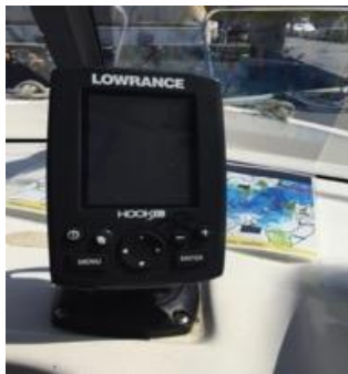
ARVOR 20 FISH FINDER