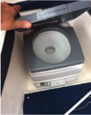
ARVOR 20 TOILET

PHONE 0447 645 321 email joe.goddard@workforcemarine.com.au