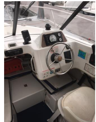
ARVOR 20 HELM AREA FULLY ENCLOSED IN CABIN