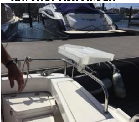
ARVOR 20 BAIT BOARD