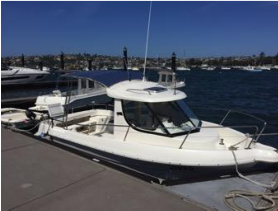
ARVOR 20 FULLY ENCLOSED OUTSIDE AREA. LARGE SWIM PLATFORM WITH SWIM LADDER

PHONE 0447 645 321 email joe.goddard@workforcemarine.com.au