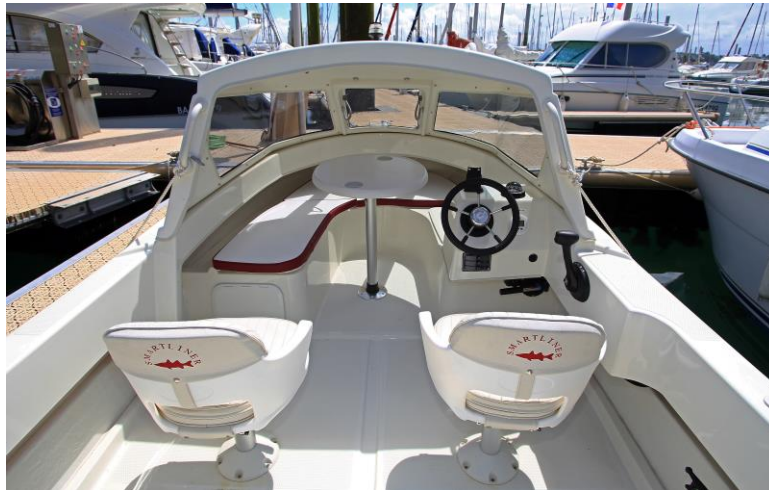
SMARTLINER 17 HAS LARGE AREA FOR FISHING AND CRUISING THE HARBOUR