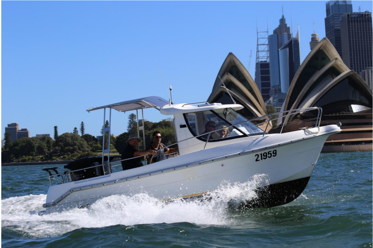
ARVOR 20 FOR UP TO 8 PERSONS