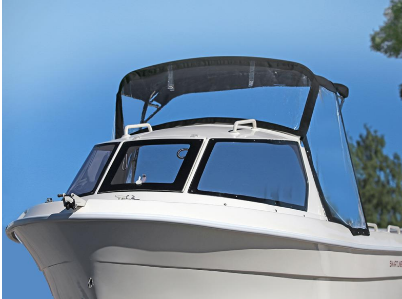
SMARTLINER 17 IS AVAILABLE FOR 4 PERSONS