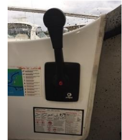
ARVOR 20 MODERN AND EASY TO USE ENGINE CONTROLS