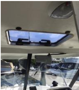
ARVOR 20 AIRY CABIN INTERIOR

LIFE JACKETS, KIDS BUOYANCY VESTS (available on request). SAFETY EQUIPMENT INCLUDES, FIRST AID KIT, FIRE FIGHTING GEAR AND EMERGENCY RADIO ABOARD