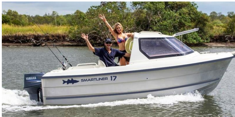
SMARTLINER 17 IS OUTBOARD POWERED